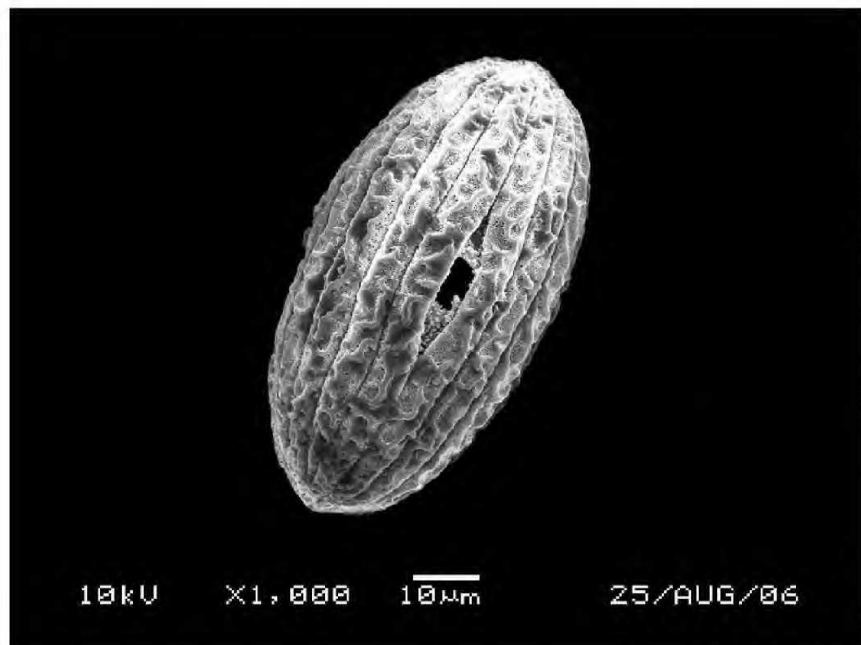
Figure 2. SEM image of pollen of Strobilanthes ovata Y. F. Deng & J. R. I. Wood. Pollen sampled from Zhou Xuan 553 (KUN).

lower lip 2-lobed almost to the base, the lobes 9–10 mm, linear-oblongate to subspatulate, obtuse; corolla light blue, 3–3.5 cm, gently curved, subventricose, outside glabrous, inside glabrous except for trichomes retaining the style, base cylindrical, ca. 10 \times 2 mm, then gradually widened to ca. 1.3 cm at mouth, subequally 5-lobed, lobes ovate, ca. 4 \times 4 mm; stamens 4, didynamous, included; filaments of the longer pair ca. 5 mm long, pilose below, the shorter pair ca. 2 mm long, glabrous; anthers oblong, ca. 2 \times 1 mm; pollen ellipsoid, tricolporate, 76.8 \times 40 \mu\text{m} , polar axis (P):equatorial diameter (E) = 1.92, ribbed, bireticulate, pseudocolpi 12, scalariform (Fig. 2); ovary oblong, ca. 2 mm, comose at tip; style ca. 2.2 cm, sparsely pilose. Capsules narrowly oblong-ellipsoid, ca. 12 \times 2 mm, glabrous except for glandular pubescence at tip, 4-seeded; seeds ovate or suborbicular, ca. 3 \times 2 mm, pilose with mucilaginous hairs.